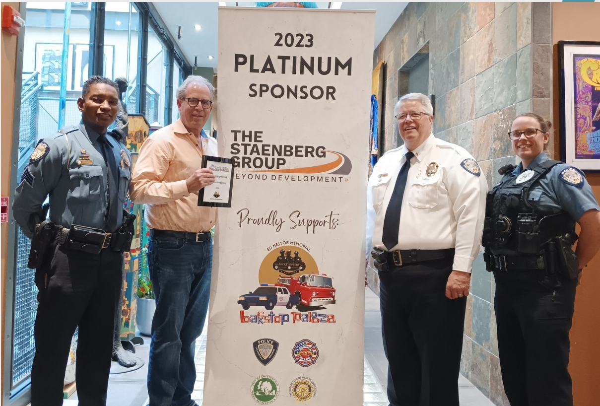
The Staenberg Group being presented their award plaque for being a Platinum sponsor from our 2023 Backstoppalooza concert event.