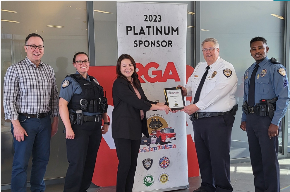
During April, the Chesterfield Police Department presented award plaques to all of our Platinum sponsors from our 2023 Backstoppalooza concert event. Pictured here is Reinsurance Group of America.