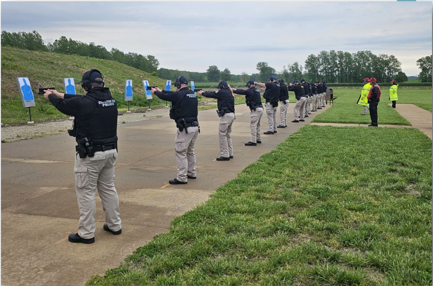
Members of the Chesterfield Police Department completing their Spring firearms training in April.